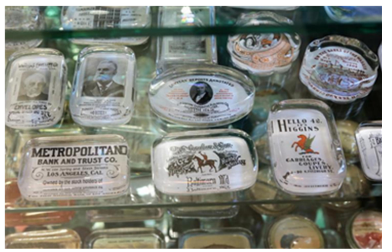
Part of the Advertising Paperweight display