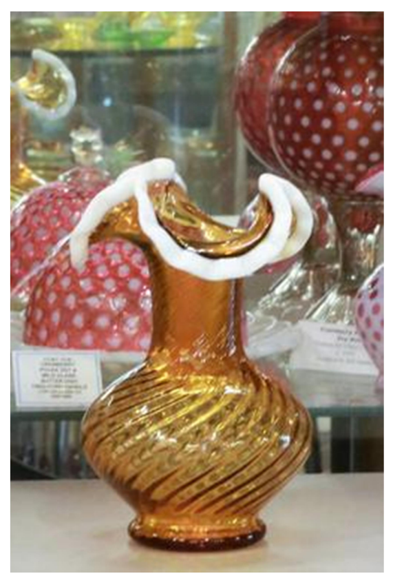
Beautiful amber Fenton Vase