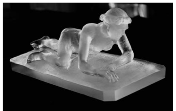
Carder (Steuben) Cire Perdue figure