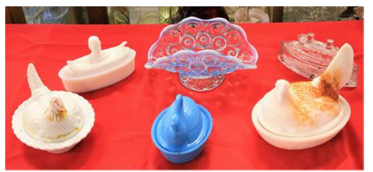
Some of the items from a recent donation by Candice Burguey