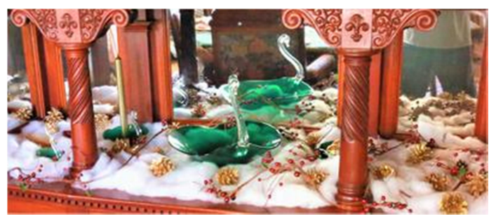
Swans in Kimberly House display