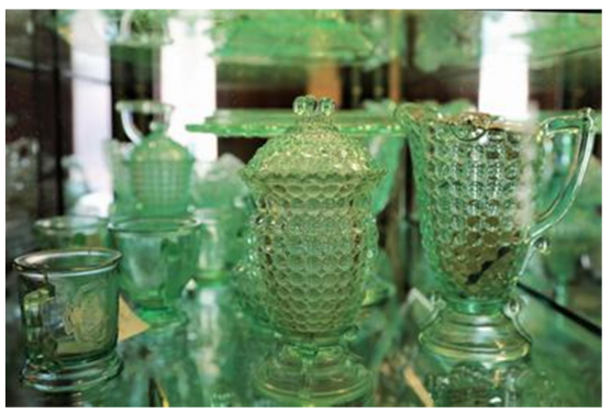
Part of the Apple Green EAPG display donated by Gretchen Urban