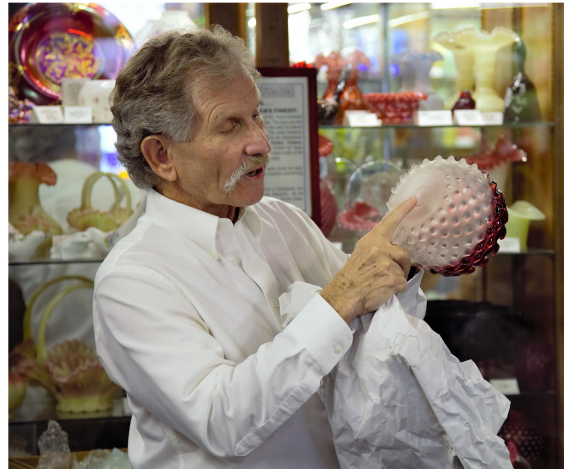
Not Fenton – Hobbs. See pontil mark