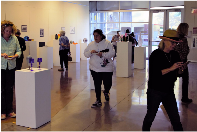
Opening day March 18

Here are some photos from this display, which featured glass from the Museum. This was a wonderful opportunity for the Museum to get exposure to the community and those interested in the arts.