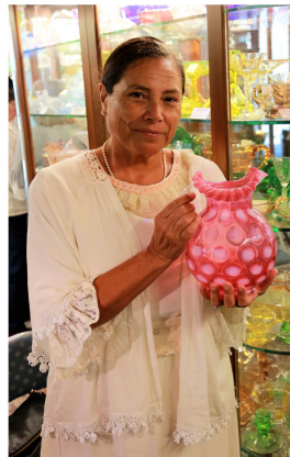
Door prize winner