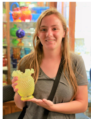
Door prize winner