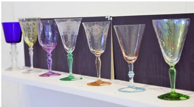
A sampling of water goblets from our collection