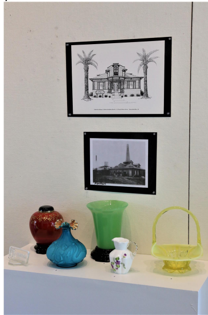
Fenton w/photo of Factory