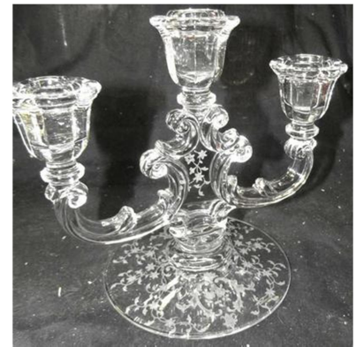
Navarre #2482 Candlestick