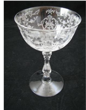
Navarre 6oz Low Sherbet