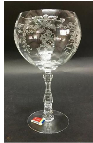
Navarre 16oz Magnum