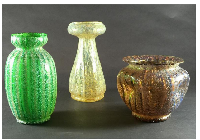
Dugan Art Glass vases (c. 1905-06)

The Board of Directors would like to thank each of these donors for their generosity.