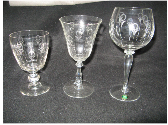
Bryce, Heisey, Czech

We ended the trip having learned a lot about cuttings, and we purchased two magnums with the sunflower cutting to go with the Bryce and Heisey goblets we already had. The glass for these magnums had been made in the Czech Republic, where Kusak was getting most of their glass since their American suppliers were out of business.