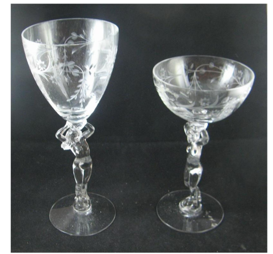
Kusak's Jasmine on Cambridge nudes

One more thing of note: Kusak's most popular cutting was called Jasmine, and we have found that pattern cut on a number of different Cambridge glass nude stem items. Sadly, like so many companies dedicated to the glass industry, Kusak has since closed permanently.