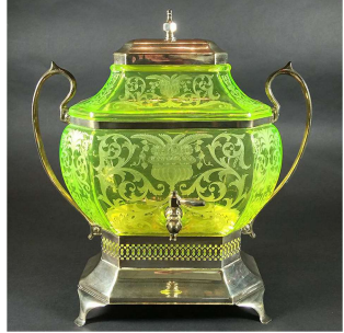
Duncan Nautical compote Cambridge Samovar

We have been featuring interesting pieces from the Museum collection on our facebook page as a way to promote interest in the Museum.