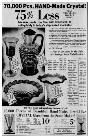
1932 Philadelphia Inquirer