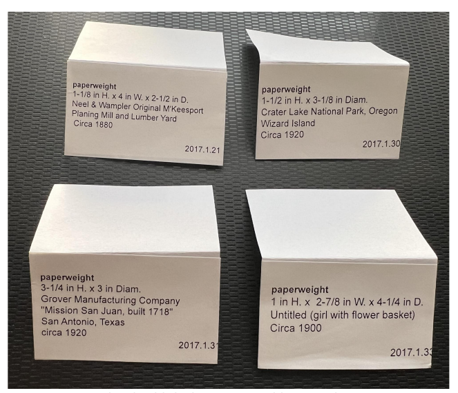
Individual labels generated by Catalogit.

This project supports the museum's mission to educate, involve and inspire the community to learn about American glass and its makers. It will generate interest in our collection. Specifically, it will support interest in studying and collecting paperweights.