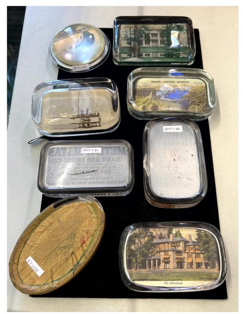
Weights with new inventory numbers new labels

Step 3: Generate new numbers and mark items along with new display labels. The Catalogit software automatically generates inventory numbers using a museum standard format including the year donated, collection number and item number. For example, 1994.1.1 indicates the item was acquired in 1994, the first collection of that year and number 1 in that group.