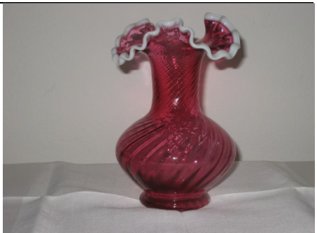
Fenton Ruby Snowcrest #3005 7 ½" vase, made September 1950 through 1954