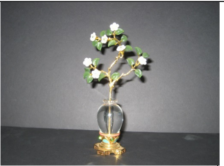
Joan Rivers "Japonica" Flower Spray in Crystal