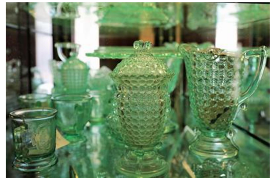
Part of the Apple Green EAPG display donated by Gretchen Urban