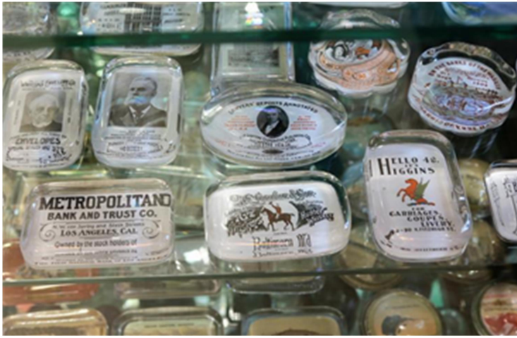
Part of the Advertising Paperweight display