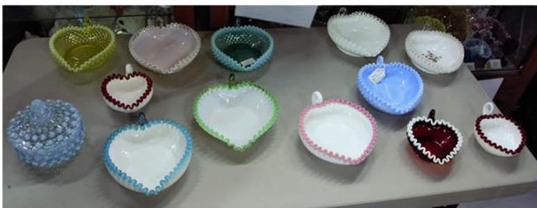
Examples from Oct 14 Seminar on Fenton's Heart-shaped Relish Dishes

May 30, 1-2PM Claremont Manor. 8-10 Persons.