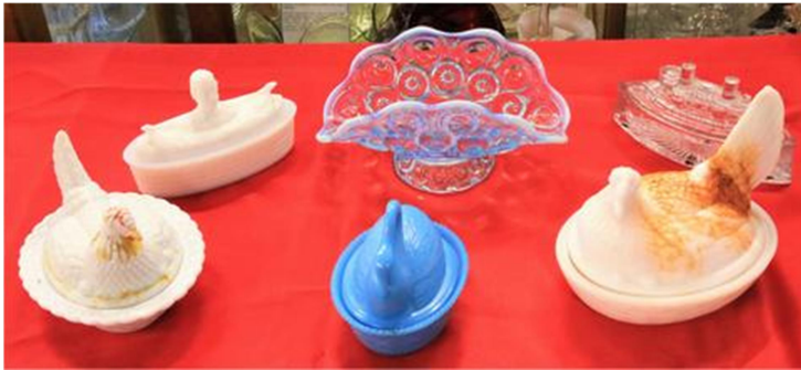
Some of the items from a recent donation by Candice Burguey