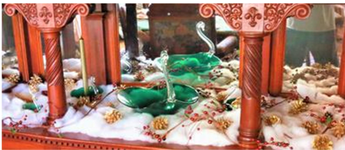
Swans in Kimberly House display