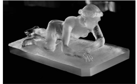
Carder (Steuben) Cire Perdue figure