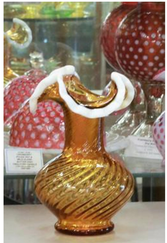
Beautiful amber Fenton Vase