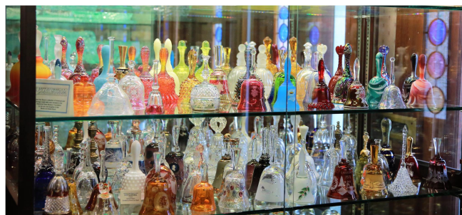
Christmas bells on display at the Museum