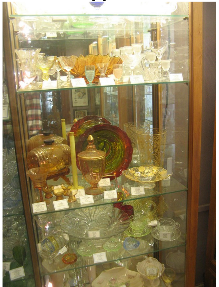
One cabinet of Cambridge glass in the Museum