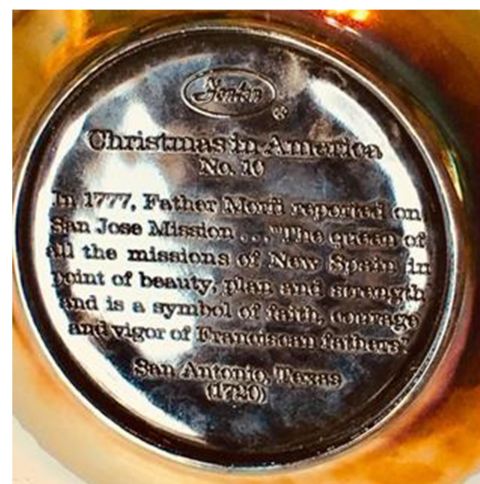
1979 San Antonio plate (reverse view)