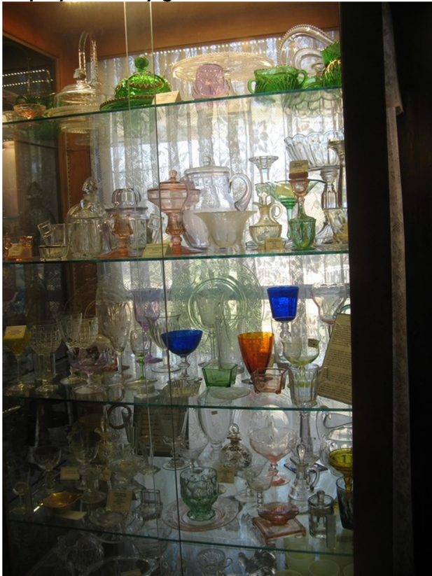
Display of Heisey glass in the Museum