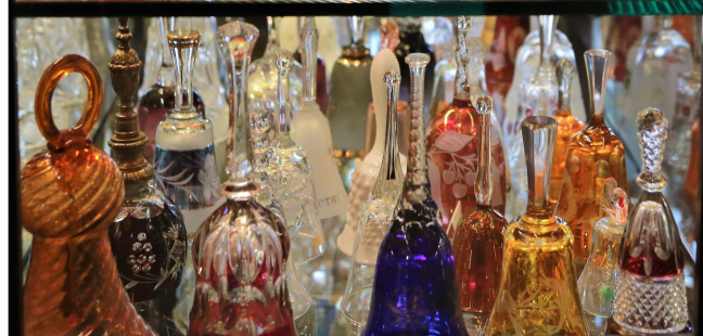
Closeup of the display