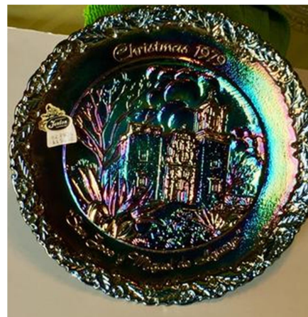
1979 San Antonio plate (front view)

The Museum has many of these Christmas Plates for sale in the gift shop.