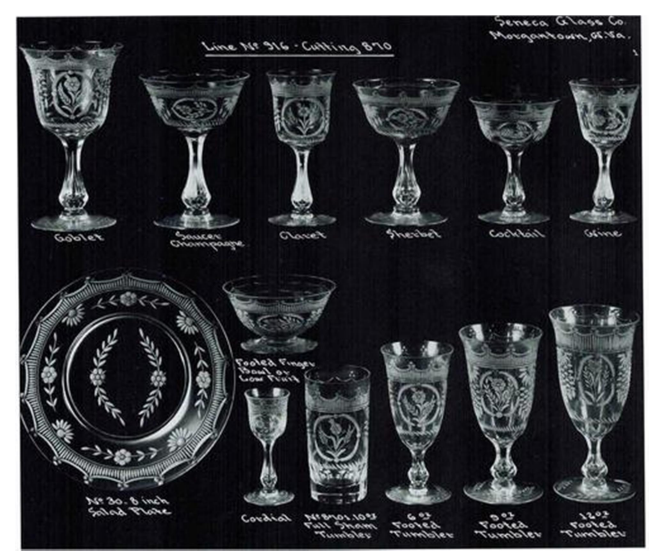
Cut stemware example