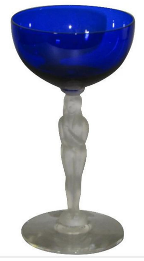
Seneca "nude" champagne