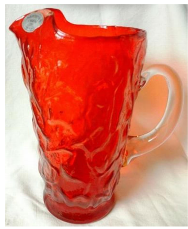
Driftwood Casual pitcher