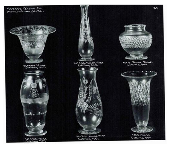
Fine cut glass