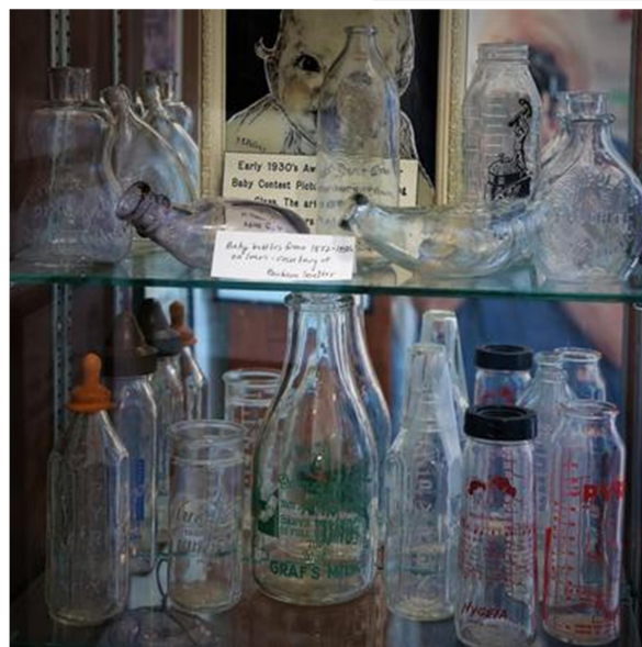
Part of Barbara Soelter's display

Speaking of baby bottles, see the article on page 3 that features two more baby bottles with some information on the manufacturers.