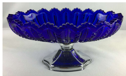
Duncan & Miller #42 – Mardi Gras footed pickle dish