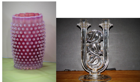
Hobbs, Brockunier Celery Fostoria #2369 Duo Candlestick

We have been posting photos featuring interesting pieces from the Museum collection on our Facebook page as a way to promote interest in the Museum.