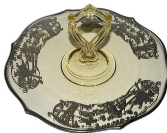
Lotus Hunt Scene

Rare pieces of Lancaster's Sphinx and most colored pieces of Lancaster's Cable or Petal with the Corn Flower etch done by the W. J. Hughes Corn Flower Company of Ontario, Canada, command fairly high prices on the collectible market.