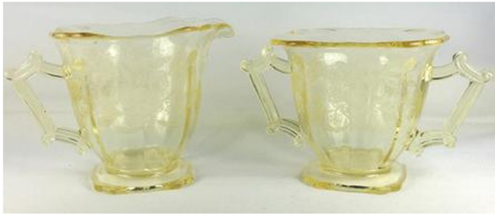
Imperial #760 etched "Bel Aire"