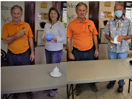
Workshop attendees with their door prizes