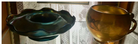
Tiffany "Favrile" items