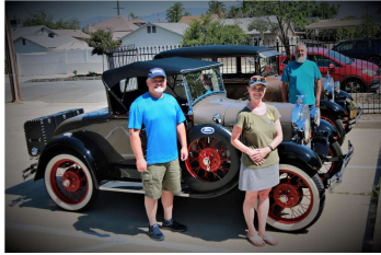
Model A's in the parking lot