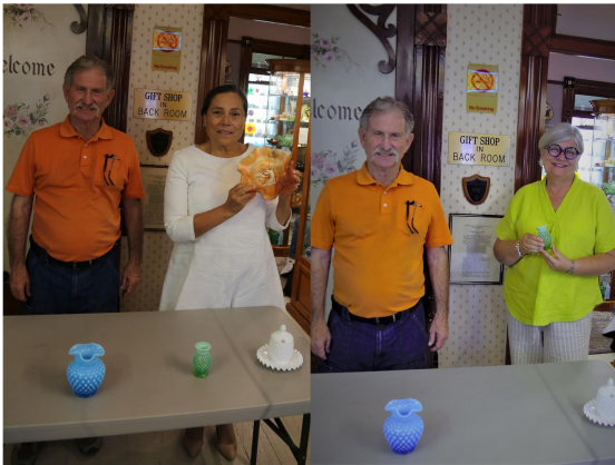
Workshop attendees with their door prizes