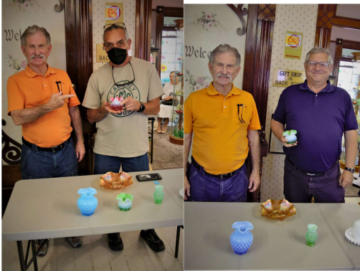
Workshop attendees with their door prizes