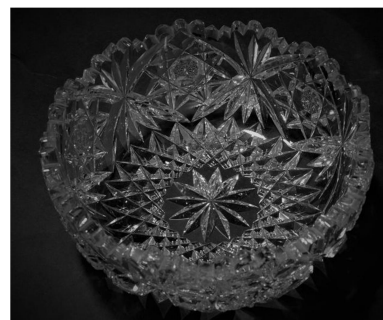
Hawkes cut glass bowl

As a way to promote interest in the Museum, we have been posting photos featuring interesting pieces from the Museum collection on our Facebook page.